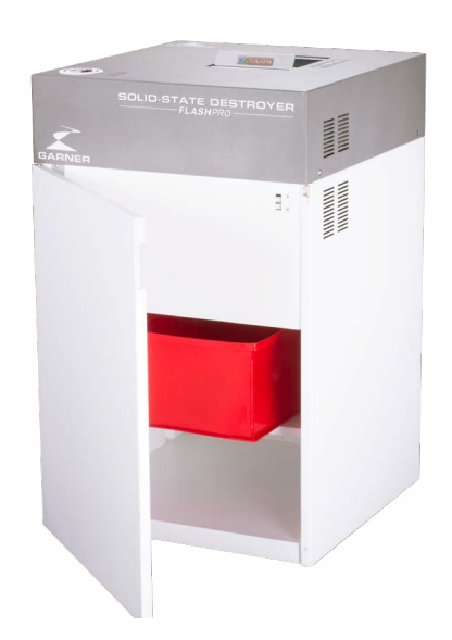
Comes equipped with catch basket and disposable liner.