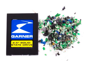
The FLASHPRO's SmartCut™ shredding system automatically adjusts to the shape of the media by reversing and forwarding the cutting wheels until the media is gripped. The cutting wheels stops when the destruction process is complete.