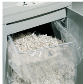
Front door for easy emptying of collecting bag