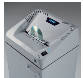
AUTO START & CD SHREDDING Automatic Start/Stop through electronic eyes. Integrated flap for CDs, DVDs, Floppy Disks and Smart Cards shredding