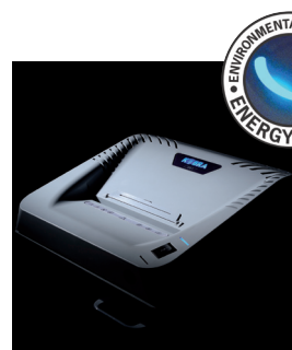
ENERGY SMART ® management system with illuminated indicators for power saving in stand-by mode