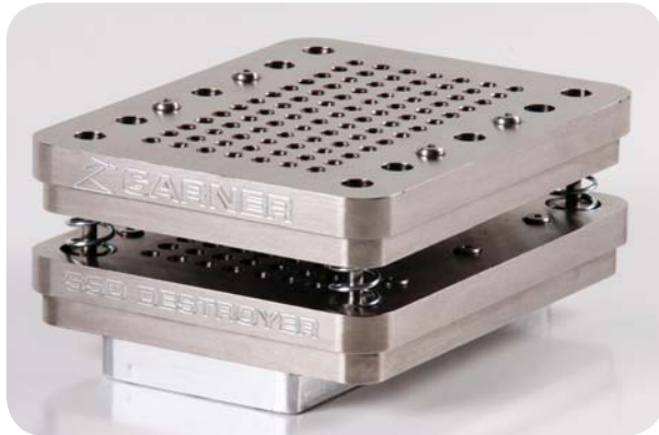
GARNER SSD DESTROYER SSD-1