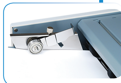
Cross Fold Guide