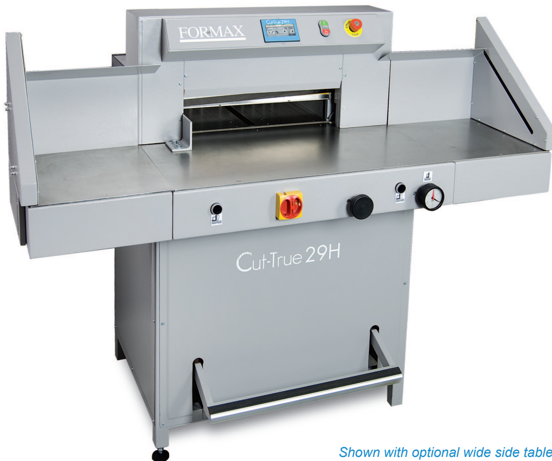
Shown with optional wide side tables

The Formax Cut-True 29H Hydraulic Guillotine Paper Cutter offers precision cutting for paper stacks up to 20.5" wide. User-friendly, intuitive features include a touchscreen control panel, automatically-adjusting back gauge and the capacity to program up to 100 jobs/100 cuts . An infrared light beam safety curtain provides safety and convenience as it shuts down operation if the light plane is interrupted.