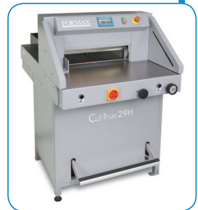
Standard model, without side tables

Formax - New Hampshire, USA www.formax.com