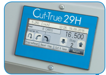
Touchscreen control panel allows for programming up to 100 jobs