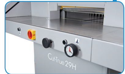
Two-button operation, fine-tune knob, adjustable hydraulic pressure gauge