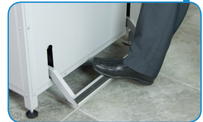
Foot pedal pre-clamp holds paper to check alignment prior to cutting