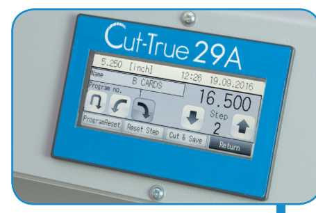
Touchscreen Control Panel allows for programming up to 100 jobs