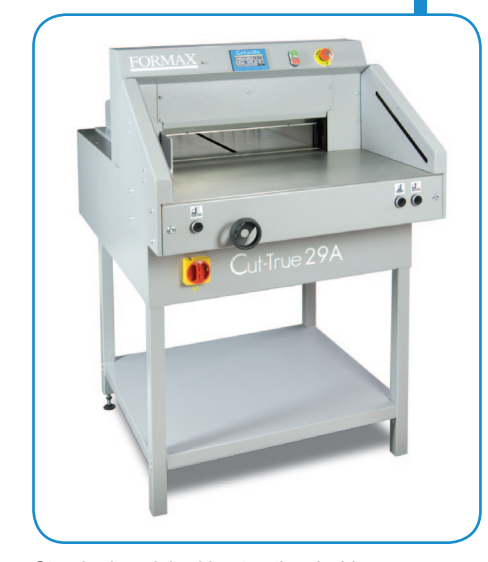
Standard model, without optional wide side tables

Formax - New Hampshire, USA www.formax.com