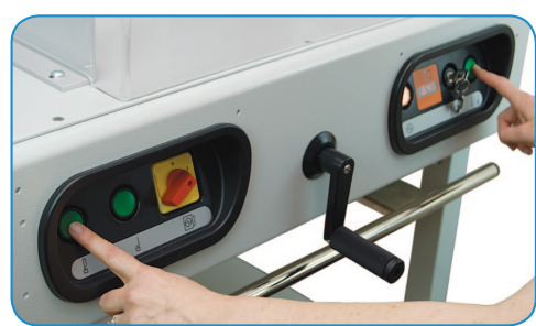
Two-Hand Operation Automatically engages clamp and blade, keeping hands away from the cutting area