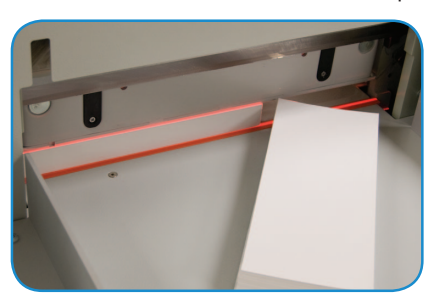
Crisp, accurate cuts Hardened steel blade for razor sharp cuts

Push-button automatic clamping is quicker and easier than with a hand wheel clamp