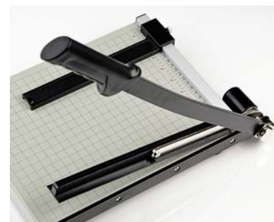
Spring action blade returns to the up position after trimming to reduce fatigue.