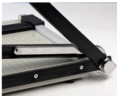
The automatic paper clamp holds work securely and prevents paper shifting.