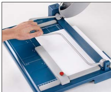
Manual clamp provides a firm hold and even pressure along the entire cutting surface.