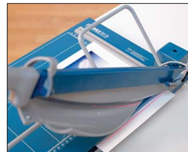
Laser guide illuminates the entire cutting line to show exactly where the cut will be.