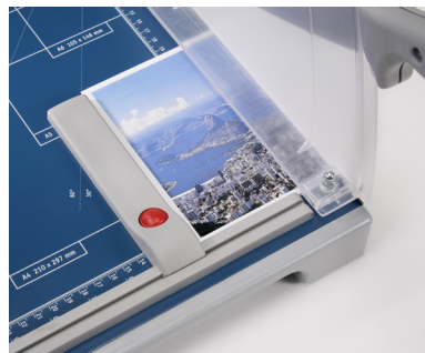
This Dahle trimmer features a manual clamp with built-in finger protection.