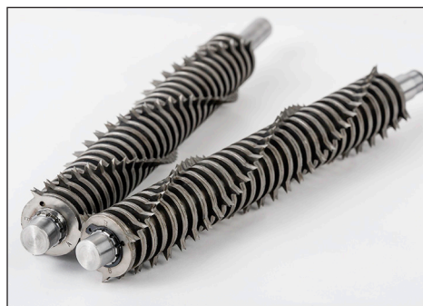
Aggressive cutting edges are fused to a steel shaft, creating an incredible bond and superior performance.