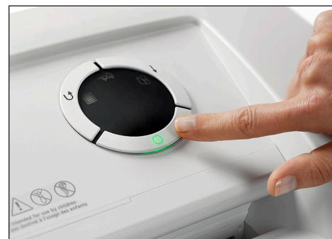
The easy-to-use command dial controls all shredder functions including power up, reverse, and continuous run.