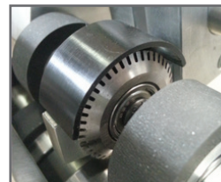
Linear Perf Standard