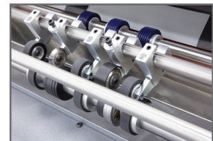
Linear Score Standard

The COUNT™ PerfMaster Sprint is a simple-to-use top-feed perforating and scoring solution that gets the job done quickly – with speeds of up to 12,000 sheets (8-1/2" x 11") per hour.