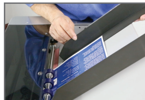
Top Friction Feed