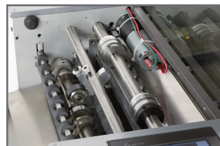
Rotary Action Creasing Assembly