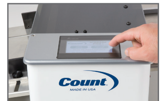
Touch Screen Controller

The COUNT™ iCrease Pro + is a robust solution for creasing and perforation of digital media to eliminate cracking when folding. Get all of the automation of bigger COUNT machines in a simple hand-feed machine anyone can use. The iCrease Pro + can crease and perf in one pass (no need to refeed!), with multiple crease locations and perfect bind covers, with choice of automatic hinge placement or no hinge.