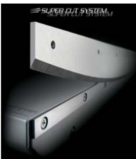
SUPER CUT SYSTEM Carbon hardened steel blades and counter-blades with 65° sharpening for long-lasting cutting operations