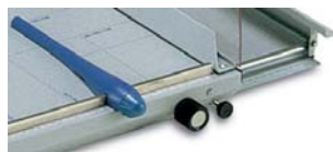
GEAR DRIVEN FRONT PAPER BAR For perfect paper alignment and cutting accuracy