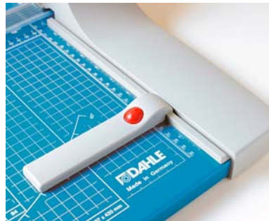
Adjustable guide can be mounted on either side of the trimmer to easily line up repetitive cuts.