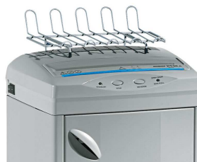
Computer forms top shelf to save office space (Space Saving Design)