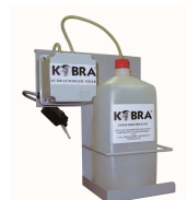
KOBRA "ACCU-FLOW" Automatic oiling system Performs automatic lubrication of the cutting knives for maximum shredding capacity (option)