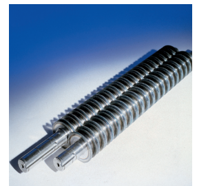
CUTTING KNIVES IN HARDENED STEEL unaffected by staples and metal clips