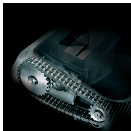
CHAIN heavy duty chain drive system and metal gears