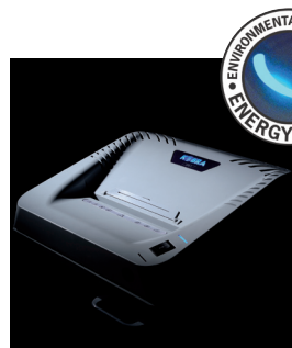
ENERGY SMART ® management system with illuminated indicators for power saving in stand-by mode