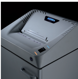
LED INDICATORS Easy to operate ON OFF Reverse switch, with LED signal for bag full or open door