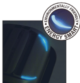
"ENERGY SMART" Management system for power saving stand-by mode