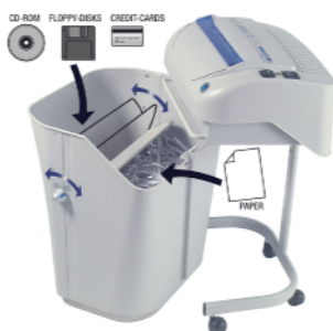
Removable waste bin with a special mechanism to separate shredded paper from plastic shreds of credit cards, CD-Rom and Floppy-Disks