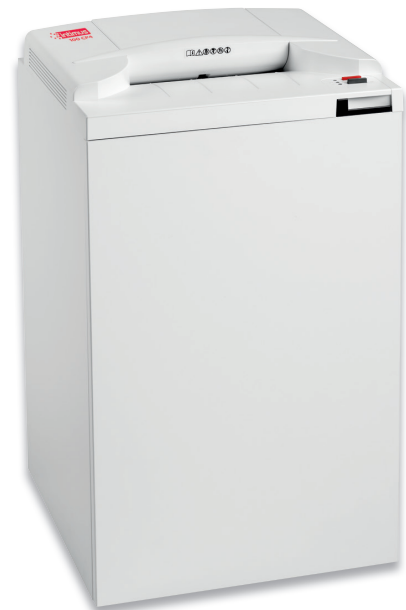
W/D/H 49 x 44 x 90 cm