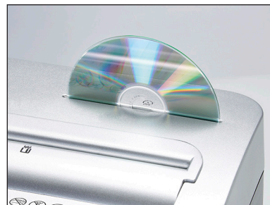
Multi+Media- This machine easily shreds CDs' credit cards, paper clips and staples.