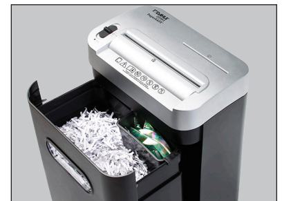
Easy to empty waste bin- Pull open front to empty multi+media container or shred bin.