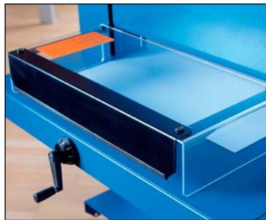
For protection, the blade will not move until this safety cover is placed in the down position.