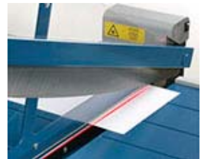
Optional laser ensures accuracy by illuminating the cut line across the entire cutting surface.