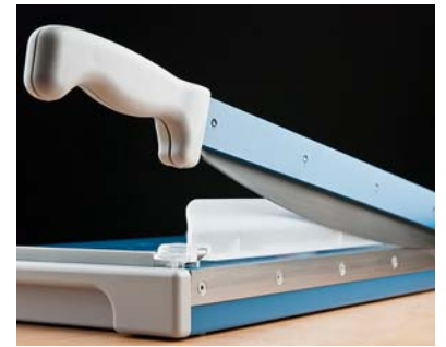
The ground, self-sharpening cutting blade produces a clean, burr free cut.