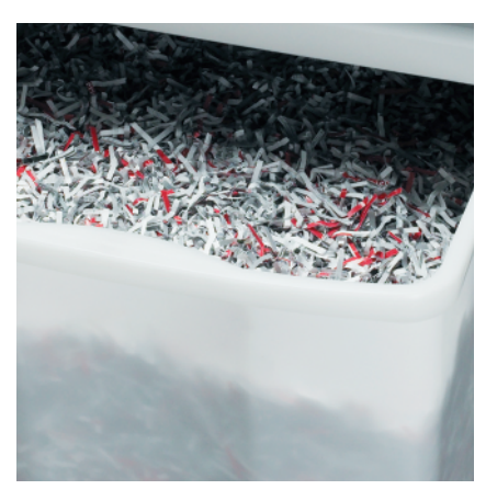
ENVIRONMENTALLY FRIENDLY BIN

On CD capable models, the electronically controlled shield protects the operator from stray splinters of plastic.