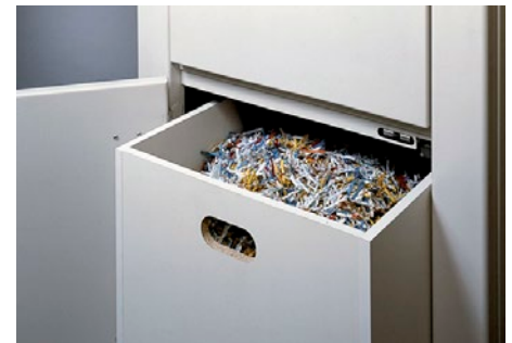
Rolling castors beneath a wooden waste bin allows for easy removal of the 50 gallon waste container.