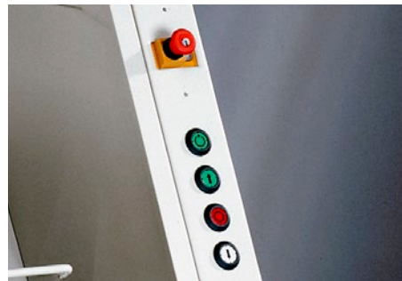
Conveyor of rollers on each side allows for easy removal of the 50 gallon waste container.