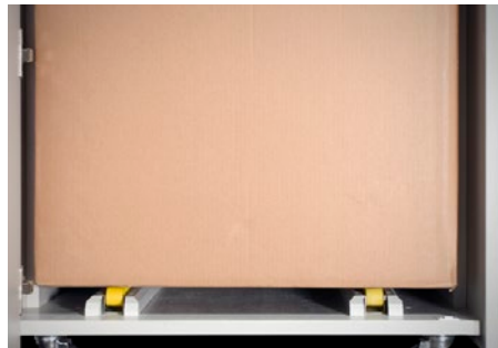
Conveyor of rollers on each side allows for easy removal of the 50 gallon waste container.