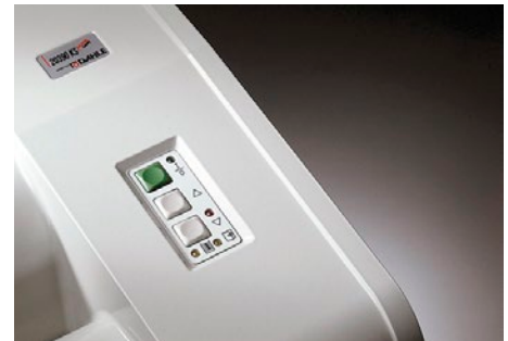
The electronic control panel allows for auto on/off, continuous run, and reverse operation.