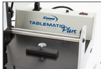
Magnetic Back Stop