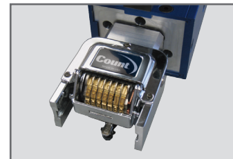
Numbering Head Wheel With Font Style Gothic (7)

The COUNT™ TableMatic Plus offers an easy, economical numbering solution that's ideal for small jobs that turn quickly. The TableMatic Plus can be used for crash numbering of NCR forms up to 6 parts, or numbering virtually anywhere on the paper. The simple foot pedal operation means anyone in your shop can use it, yet offers a range of features: drop zeros, a repeat function, numbering head pressure adjustment and a patented self-inking cartridge. Plus, a magnetic backstop and built-in side rails ensure consistently accurate registration.