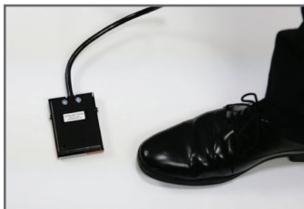
Simple Foot Pedal Operation

This simple-to-use numbering solution accommodates small jobs for quick delivery to your customers.