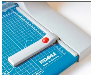
Adjustable guide can be mounted on either side of the trimmer to easily line up repetitive cuts.