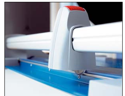
Features a ground self-sharpening rotary blade that cuts in either direction.